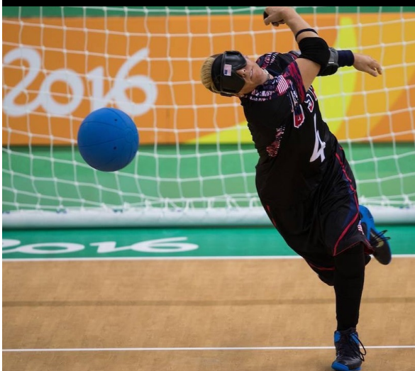
ASNW Rose City Thorns athletes played Goalball on the Rio US Paralympic Team - and won a Bronze medal