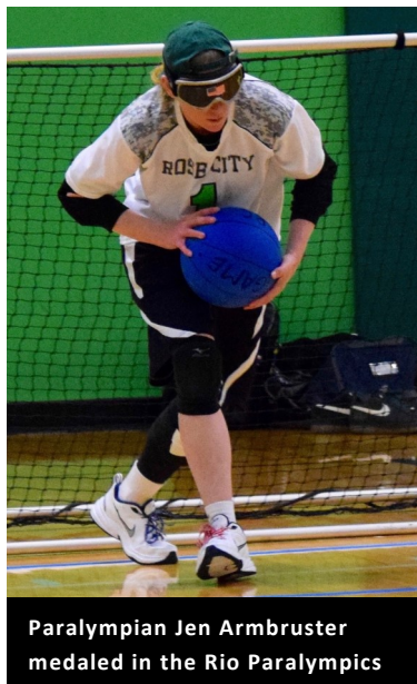
Paralympian Jen Armbruster medaled in the Rio Paralympics