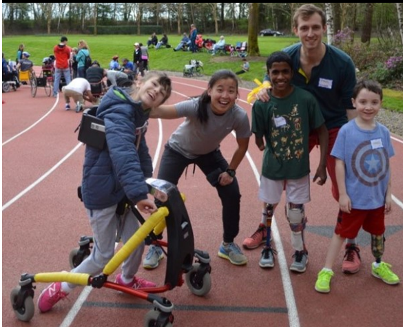
ASNW participated in a Track & Field Clinic co-hosted by US Paralympics and Nike